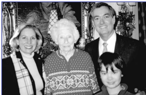
The Governor and First Lady hosted a Rainbow Bridge intergenerational gathering. (Story on page 1.)